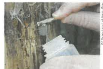
Figure 3. Scraping SLF egg masses from a tree.

Walk around your property to check for egg masses on trees, cement blocks, rocks, and any other hard surface. If you find egg masses on your property from September to June, you can scrape them off using a plastic card or putty knife (Figure 3). Scrape them into a bag or container filled with isopropyl alcohol or hand sanitizer. This is the most effective way to kill the eggs, but they can also be smashed or burned. Remember that some eggs will be laid at the tops of trees and may not be possible to reach.