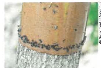
Figure 4. A banded tree with SLF nymphs stuck at the bottom.

When the nymphs first hatch, they will walk up the trees to feed on the softer new growth of the plant. Take advantage of this behavior by wrapping tree trunks in sticky tape and trapping the nymphs.